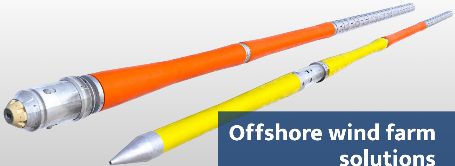
NjordGuard Monopile and J-Tube capable